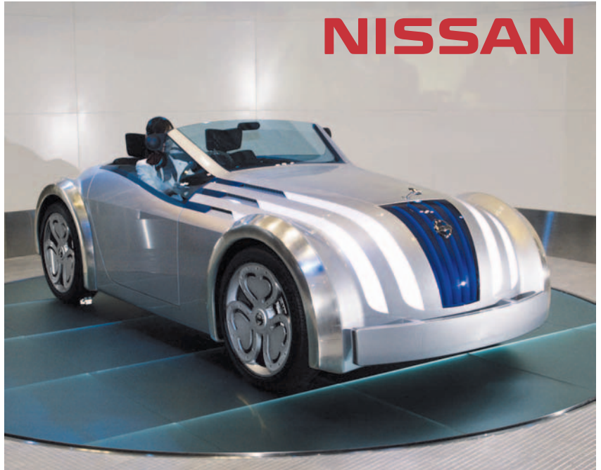
"JIKOO" is designed with Edo period craftsmanship.

Next to the "Fuga" is the "Serenity," a fusion of the sports sedan and the minivan. With room for six, this is a multipurpose saloon, but it brings new levels of luxury and comfort to the genre. Here too the design theme was "Japanese DNA," and the interior, with its cool, serene styling, projects a refined tranquility that is characteristic of Japanese culture.