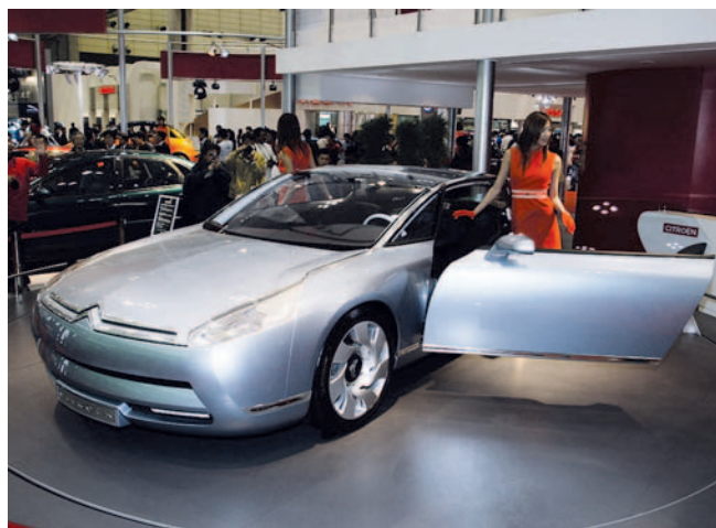
"C-Airdream" offers superb aerodynamics.

The "C3 Pluriel" reference exhibit features a removable roof arrangement and that allows for a number of different body types in this uniquely structured and eminently fun car.