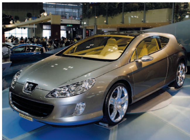
The "407 Elixir" stands out at the Peugeot booth.

All of the models on display provide a glimpse into Peugeot's future design motifs. They feature a subtle combination of dynamism and elegance, and these new sensibilities can clearly be seen in, for example, the coupe-like three-door station wagon that eliminates partitions and parcel shelves to create a one-room feel.