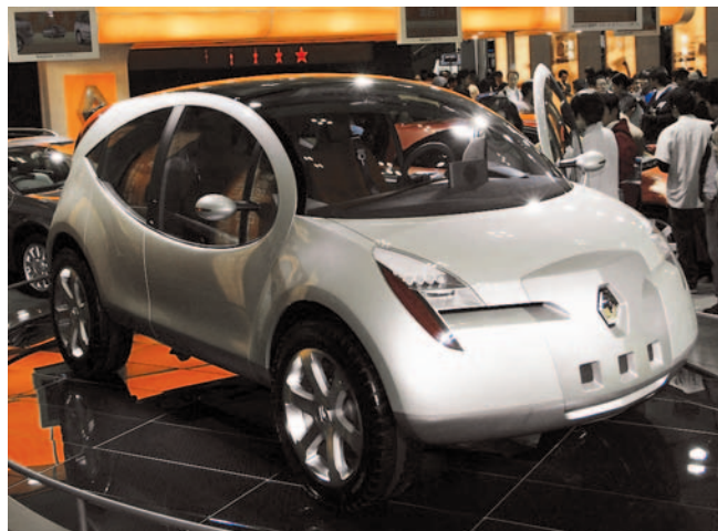
The "Be Bop" (SUV) shows where the future is heading.

The commercial model was named the 2003 European Car of the Year and is scheduled for launch in Japan next year. Other highlights include the "Mégane 2.0 Premium," "Mégane Coupé-Cabriolet," and "R23" F-1 machine.