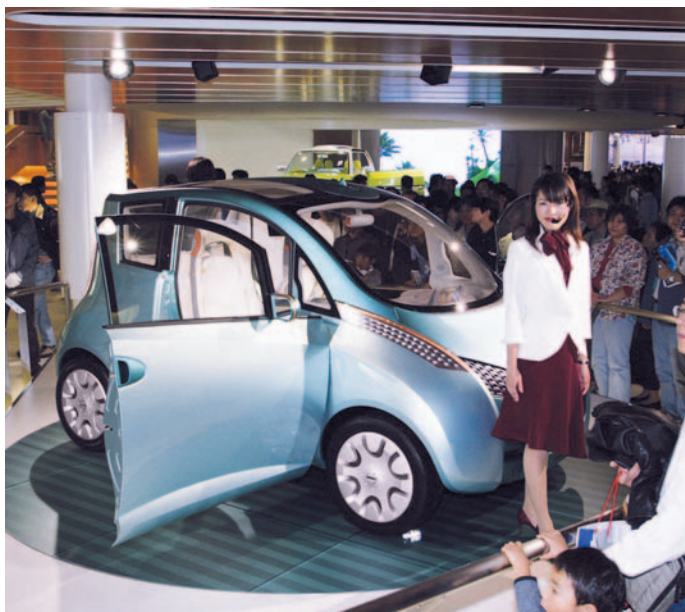
"EFFIS" has a newly developed "Super Motor" with two outputs.