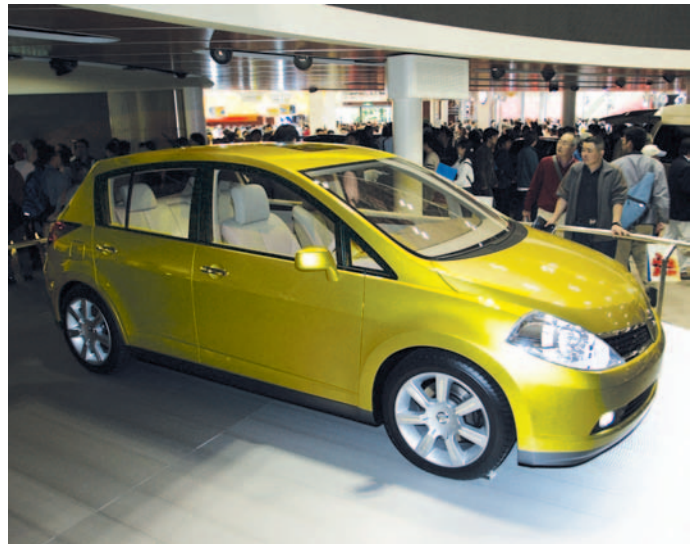
"C-NOTE" explores new possibilities for the "petit-premium" car.