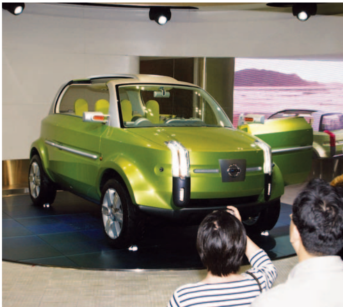
"REDIGO" stores its glass roofs in the classrooms on either side automatically.