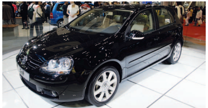
"Golf" gets its first full model change in 6 years. It will be launched in Japan next year.