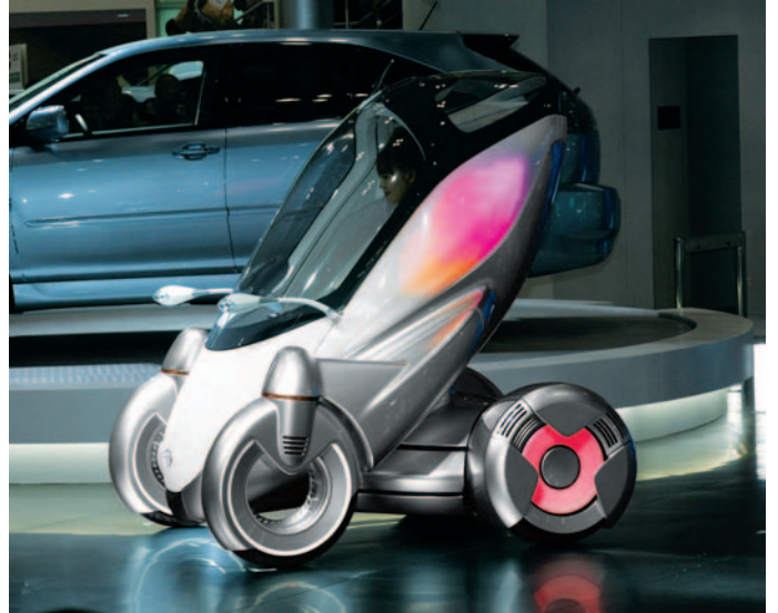
The "PM" stage demonstration wows crowds.