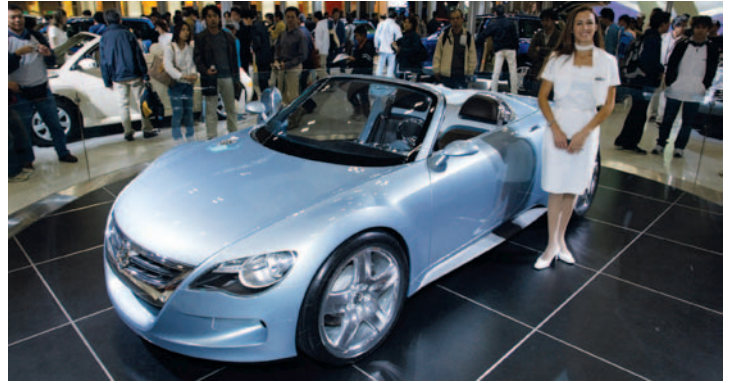
The "Concept R" two-seater roadster, VW's new sports car.