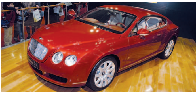
"Continental GT" is handmade by traditional craftsmanship.

Also in the Bentley corner is the "Arnage T," a luxury saloon with a V8 6.75 liter twin turbo engine, a car that exudes everything one would expect from this prestige maker.