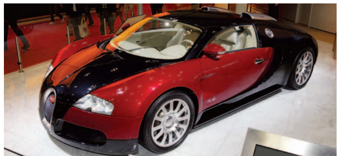
Bugatti's "Veyron 16.4," with the atmosphere of being the king of sports cars.

The carbon fiber monocoque body is designed not only to be lightweight but to give extra performance at high speeds. Among the unique body features is the rear wing, which serves as a "parachute" for deceleration from high speeds. The interior features luxury metal applications and a very easy-to-view arrangement of the driving elements. This conjures an image of being the king of sports cars.