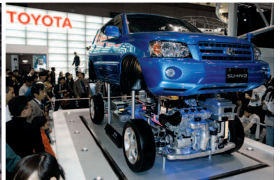
Next generation of hybrid technology on display.