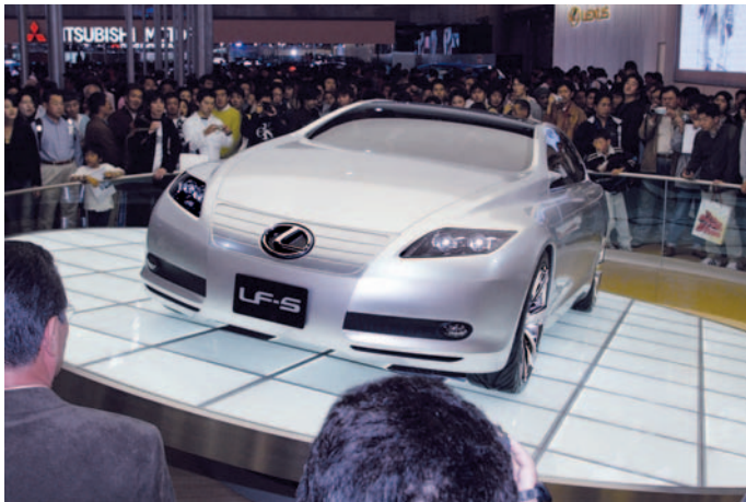
The "LF-S," a new Lexus model scheduled for launch in Japan.