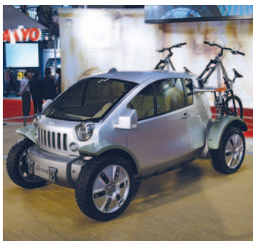
"Treo" expands the Jeep world.

The impression that one gets from this show is that the "dream cars of the future" are just around the corner. It was not too long ago that fuel cell vehicles were the "next generation" of clean energy vehicles. Now you can see them on the streets, and hybrid vehicles are quite common too. It is amazing how fast technology has advanced. IT is also bringing new technologies to the automobile such as "assisted parallel parking" and "collision shock reduction" systems. This year's show includes a wide variety of concept cars that illustrate just how advanced driving will be in the very near future.