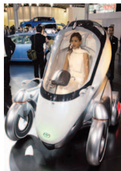
"PM" adjusts the driver's seat according to running speed.