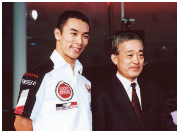
Mr. Takuma Sato, who placed sixth in the F-1 Japan Grand Prix after entering "on a lark" talks with Honda President Fukui.

This year saw the first press briefings for three newly appointed presidents, Takeo Fukui of Honda, Hisakazu Imaki of Mazda and Hiroshi Tsuda of Suzuki. Fukui said, "Our theme is 'liberating technology' that embodies the innovative concepts generated by free thinking." Imaki and Tsuda emphasized the "freshness" of their vehicles, focusing their remarks on concept cars and new models.