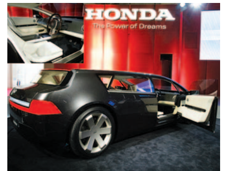
"KIWAMI", a simple form with a traditional Japanese flair.