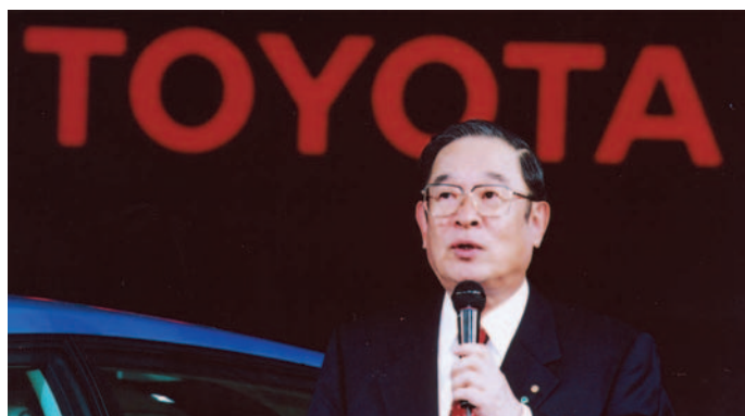
Toyota President Cho emphasizes that "environment is our highest priority."

At bat for Toyota was President Fujio Cho, who declared that "the automobile has no future unless it takes account of the environ-