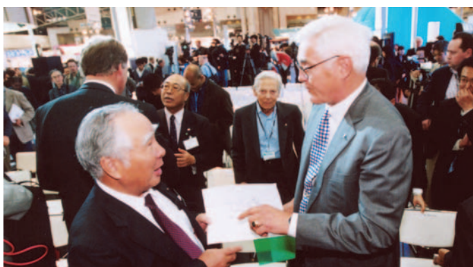
Suzuki Chairman Osamu Suzuki (left) with GM Vice President Lutz in the GM corner.