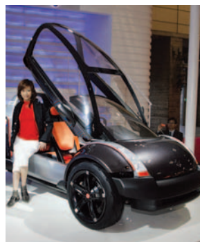
"S-RIDE" for the urban commuter.